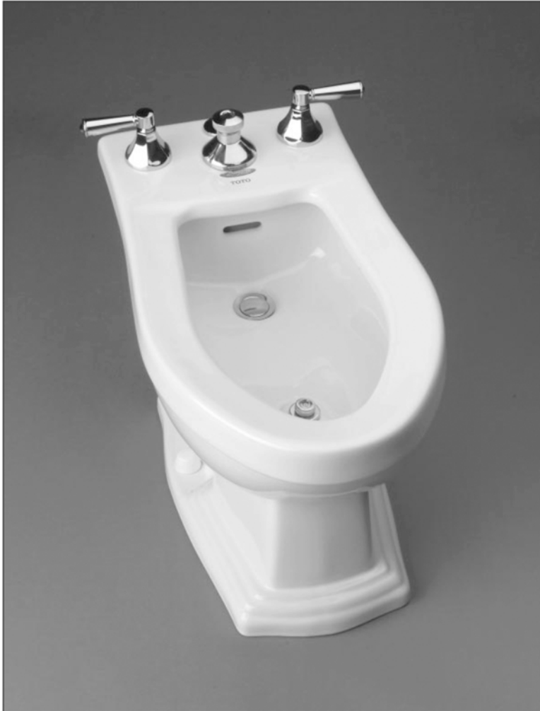
BT784B - Clayton Bidet